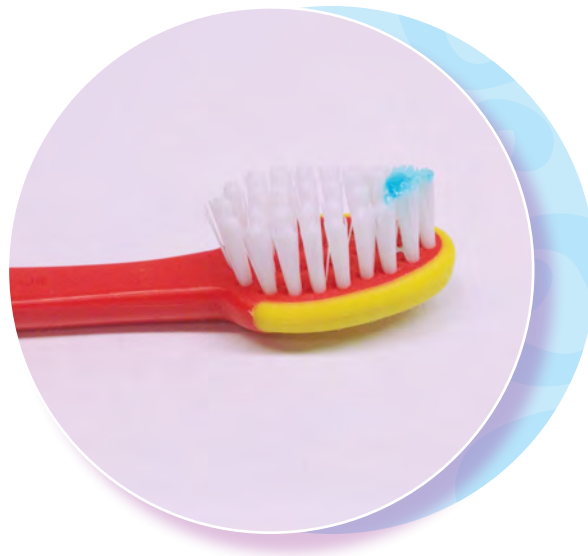
Use a smear of fluoride toothpaste.

This handout was prepared by the National Center on Early Childhood Health and Wellness under cooperative agreement #9OHC0013 for the U.S. Department of Health and Human Services, Administration for Children and Families, Office of Head Start.