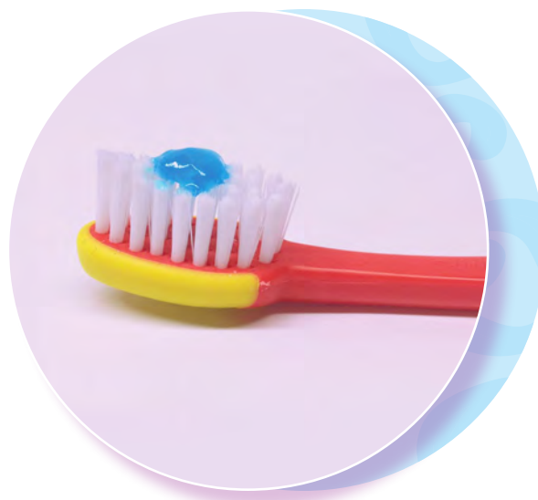
Use a pea-size amount for children ages 3 to 6.

This handout was prepared by the National Center on Early Childhood Health and Wellness under cooperative agreement #9OHC0013 for the U.S. Department of Health and Human Services, Administration for Children and Families, Office of Head Start.