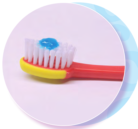
Use a pea-size amount for children ages 3 to 6.

This handout was prepared by the National Center on Early Childhood Health and Wellness under cooperative agreement #9OHC0013 for the U.S. Department of Health and Human Services, Administration for Children and Families, Office of Head Start.